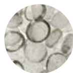
CLEAR GLASS BEADS